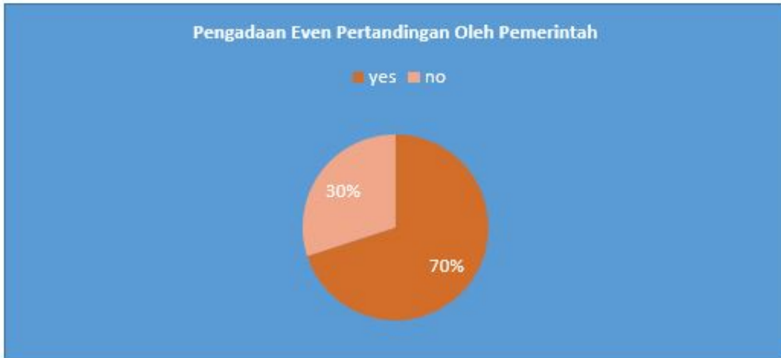
Figure 4. Percentage of Procurement of Sports Match Events

Based on the questions given by the research team regarding the question "After holding several sports as sport tourism, do you want the government to hold a match event in this Southeast Aceh Regency? The answer is Yes/No." The results of the data above show that the answers from the community to the questions given are for Yes answers, which have the highest percentage, namely 70% and 30% for No answers.