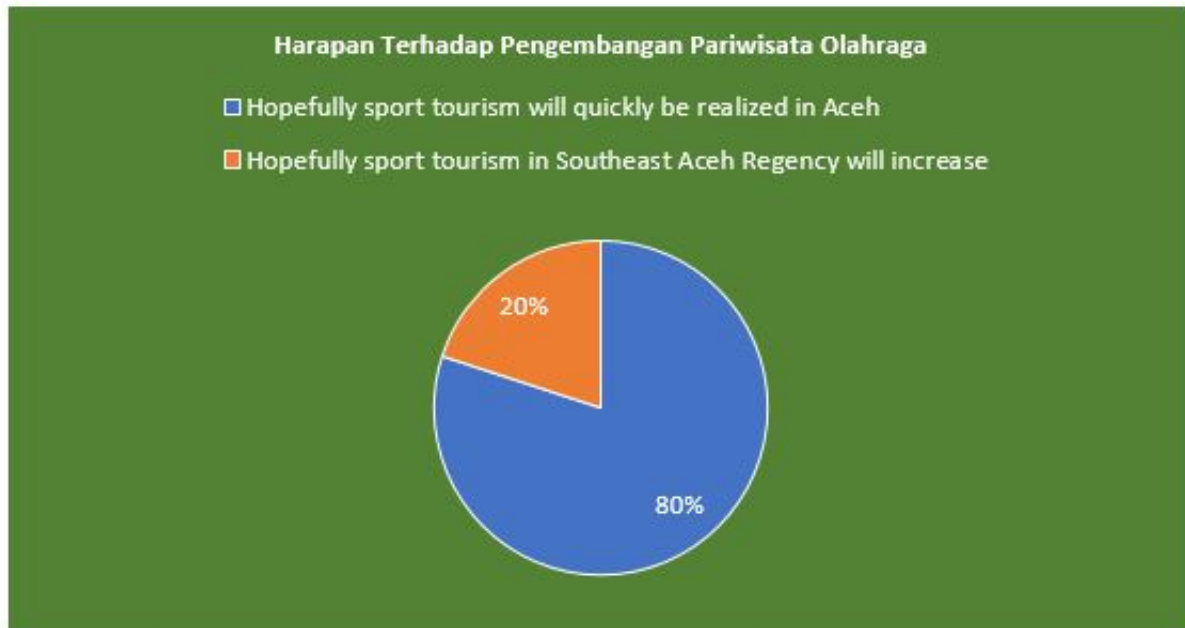
Figure 6. Percentage of Community Expectations

Based on the questions given by the research team regarding the question "What are the future expectations for tourism development in Southeast Aceh Regency?". The results of the data above show that the answers from the community to the questions given are for answers. Hopefully sport tourism in Southeast Aceh Regency will be realized and tourism in Southeast Aceh Regency will have more and more visitors with the largest percentage, namely as much as 80% and as many as 20% for answers. Southeast Aceh regency is getting more and more attention from the government[10].