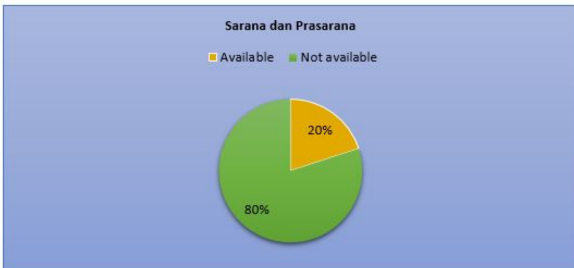
Figure 5. Percentage of Teletubbies Hill Ilalang Tourism Facilities and Infrastructure

Based on the questions given by the research team regarding the question "After holding several sports as sport tourism, do you want the government to hold a match event in this Southeast Aceh Regency? The answer is Yes/No." The results of the data above show that the answers from the community to the questions given are for Yes answers, which have the highest percentage, namely 70% and 30% for No answers.